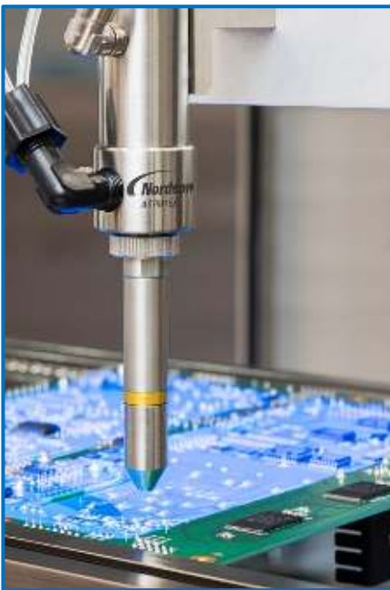
SC-350 Select Spray

The SC-350 applies less air pressure to achieve a tighter edge tolerance providing increased selectivity and control near keep out zones and reduced “cobwebbing” of solvent-based fluids. Lower air assist pressure improvements provide added flexibility within your process parameters – achieving thinner coating results at faster coating speeds for a wide range of fluid viscosities.