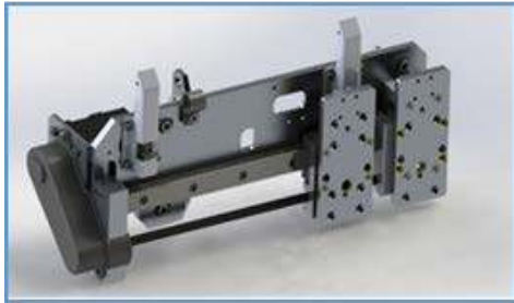
Dual-Simultaneous Programmable Pitch