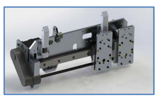
Dual-Simultaneous Programmable Pitch